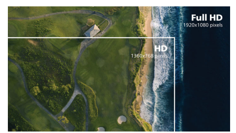
Picture quality matters. Regular displays deliver quality, but you expect more. This display

features enhanced Full HD 1920 x 1080 resolution. With Full HD for crisp detail paired with high brightness, incredible contrast and realistic colors expect a true to life picture.