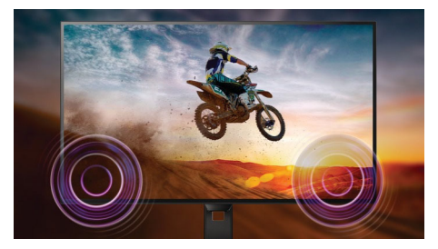
A pair of high quality stereo speakers built into a display device. It can be visible front firing, or invisible down firing, top firing, rear firing, etc depending on model and design.